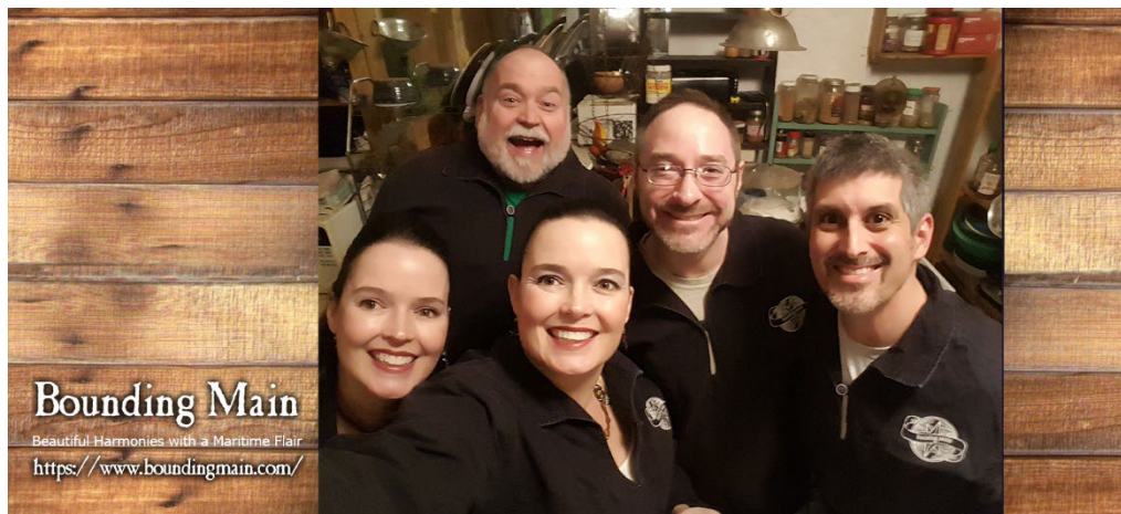
Chicago-based maritime music group, Bounding Main.